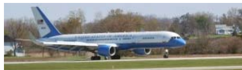
The plane carrying first lady Michelle Obama landed in Waterloo at about 9:40 a.m. Saturday, May 7, 2011. About two dozen people turned out to watch.

2 retweet Recommend You recommend this. Admin Page - Insights - Error